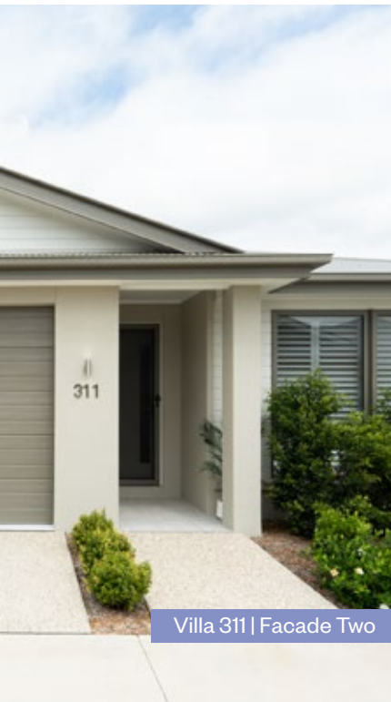
Villa 311 | Facade Two