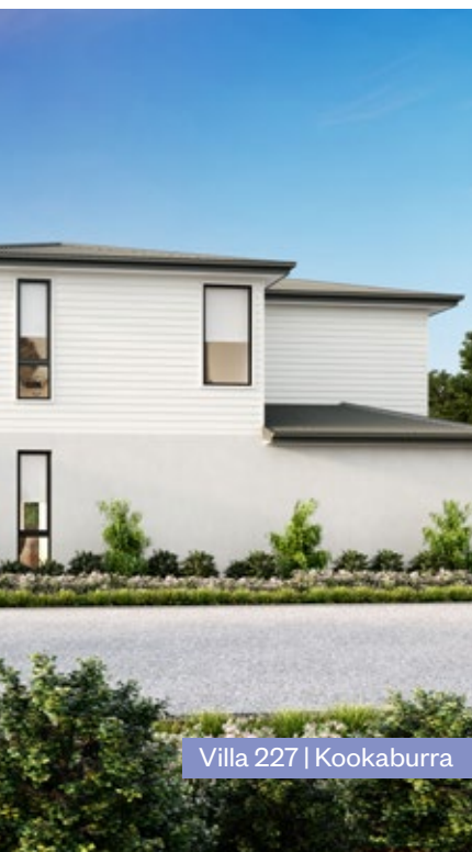
Villa 227 | Kookaburra