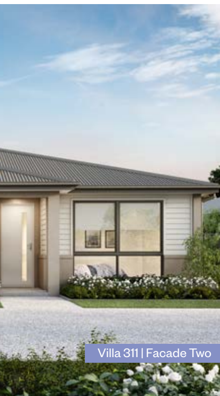
Villa 311 | Facade Two

According to Chinese astrology, dragons are most compatible with rats (those born in 1936, 1948, 1960, etc), monkeys (born in the years 1932, 1944, 1956, etc), and roosters (whose birth years are 1933, 1945, 1957, etc).