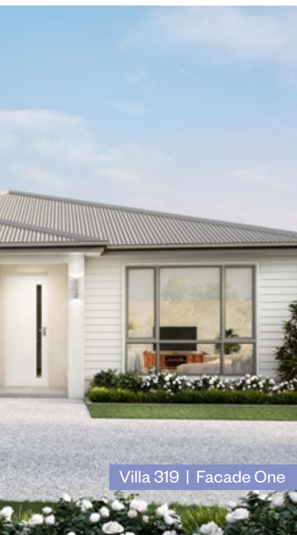
Villa 319 | Facade One