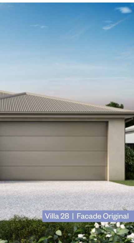
Villa 28 | Facade Original

Venture into wine country, less than one hour south of Warwick. The town also records Queensland's lowest temperatures – including occasional snow flurries. Also known as the granite belt for its striking boulder-strewn landscape, one place to stop is at Donnelly's Castle. This rock formation offers plenty of opportunity to walk between, around, and over these incredible boulders. Stop by Stanthorpe Cheese to pick up a selection of freshly cured cheeses to enjoy with lunch before exploring award-winning wineries along the way.