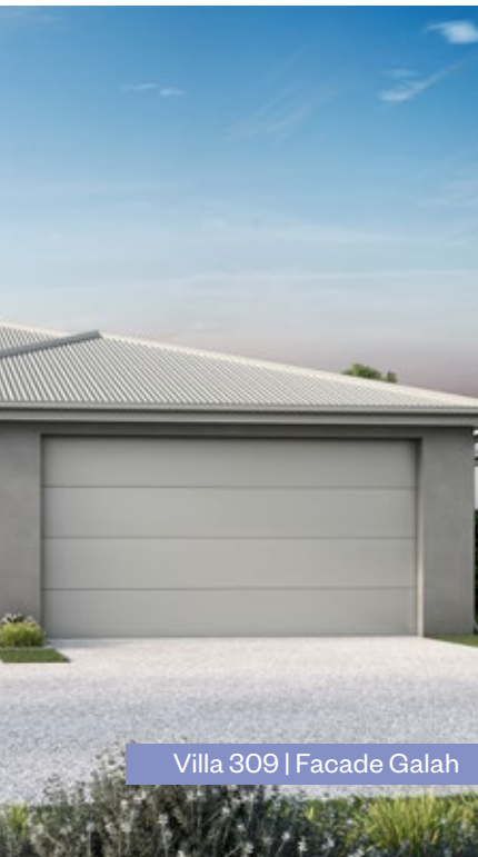
Villa 309 | Facade Galah

For more information: historicalvillage.com.au