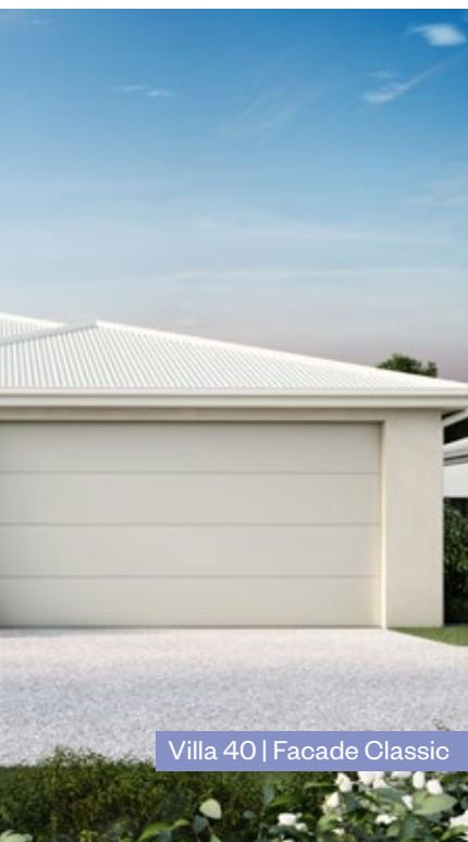
Villa 40 | Facade Classic

This is your chance to view 5 stunning display homes and learn more about our exclusive two-storey homes. Stay tuned for registration details in next month's Thrive .